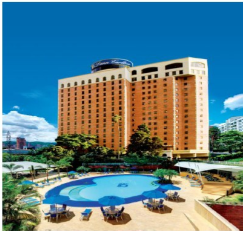
Dann Carlton Hotel

Teams who choose to book their accommodation at non-official hotels or do not book their accommodation through the LOC will have to pay "Non-Official Entry Fees" (double entry fee).