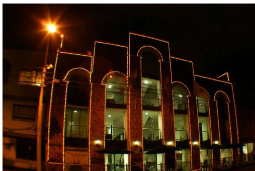
San Joaquin - Trip Hotel